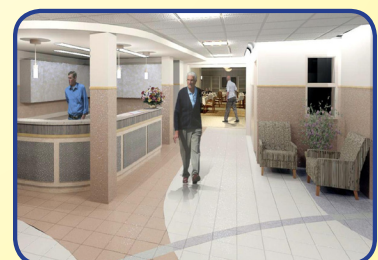
2nd Floor Nurse's Station