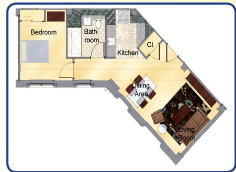
1 bedroom, 1 bath apartment (660 square feet)

Thank you for your support of The Nebraska Masonic Home!