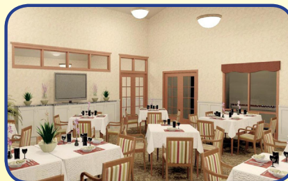
3rd Floor Dining Room