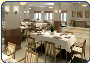
2nd Floor Dining Room